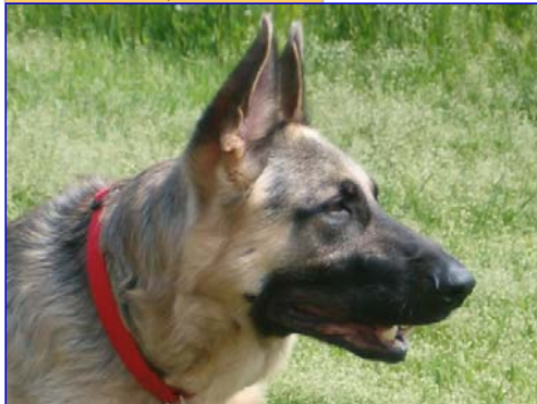
June 4, 2007

Ace is starting to get used to his new home more. He is relaxing better in the house. I think he's starting to realize this is his home now. He's been really good too. No accidents inside at all. We spend as much time as possible outside. He's not crazy about the training, but he is learning. It has been very hot lately, so we walk & train until we're both tired. He recharges very fast though!. He still has so much puppy in him! He has these little 'bursts' of energy. It's pretty funny! When not following me around, his favorite pastime is watching the cat & bugging him. it's unbelievable how many people have commented on how nice of a dog he is!