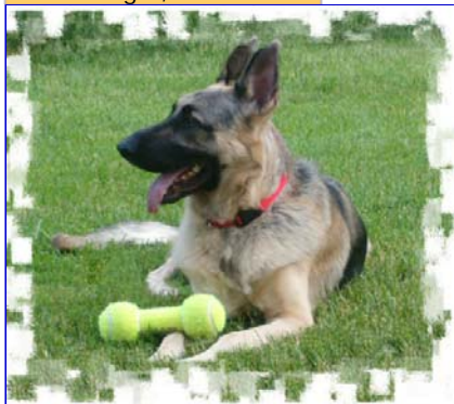
Aug 6, 2007

Ace's name was lengthened to "Casey". He is doing great! He is a big beautiful dog. We started some obedience training & he is picking [it] up very fast (I knew he would). He loves his new home. He also has some new cousins (fellow GSD's to play with) at my relative's house. He is still a big baby! He has to have his hugs all the time.