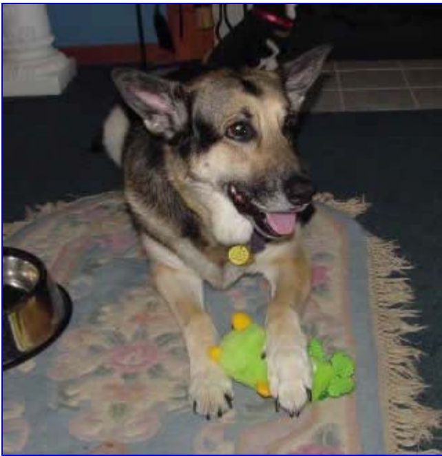
July 29, 2006